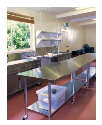
Commercial Kitchen ready for hire