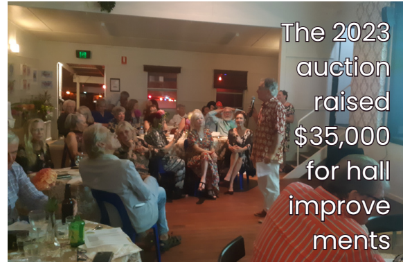
The 2023 auction raised $35,000 for hall improvements