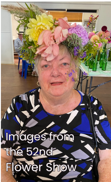
Images from the 52nd Flower Show