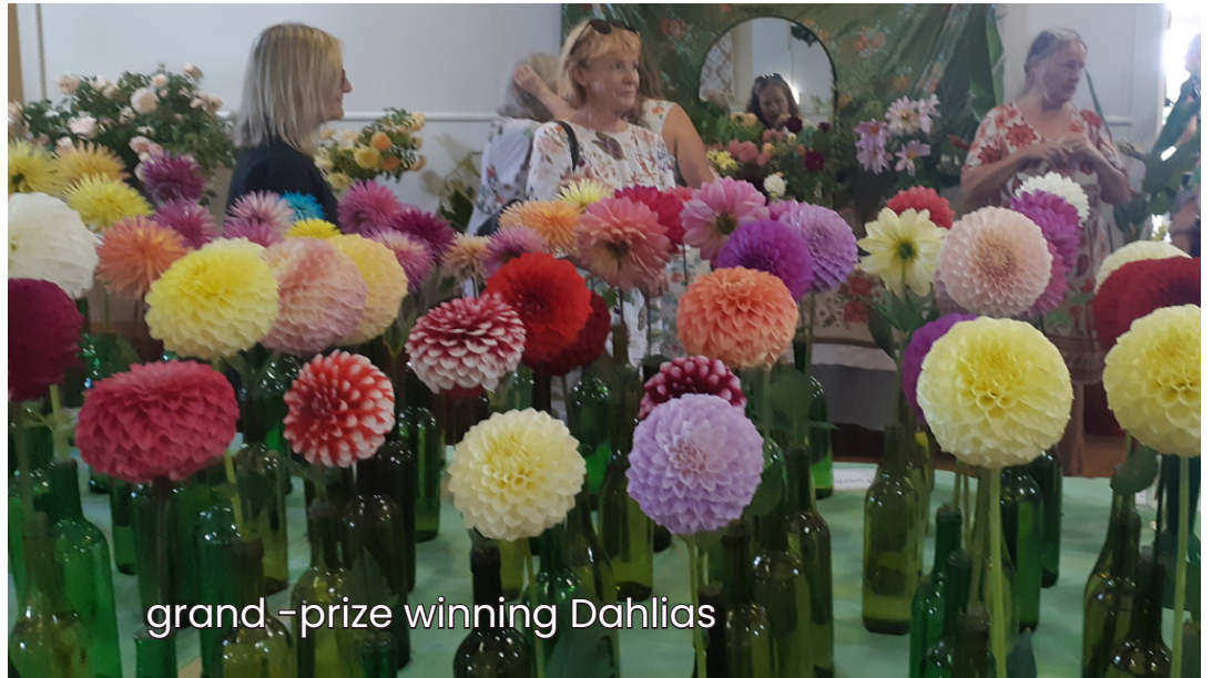
grand-prize winning Dahlias