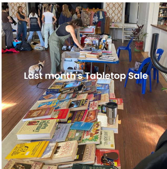
Last month's Tabletop Sale

Enquiries open for workshop/s - art, music, performance, cooking,