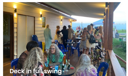
Deck in full swing