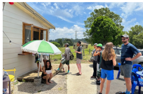
Young Makers XMas Market