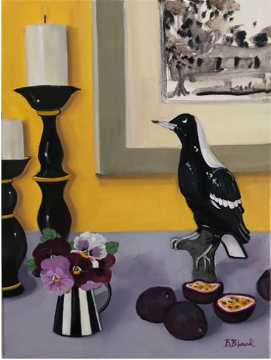
artist Belinda Black